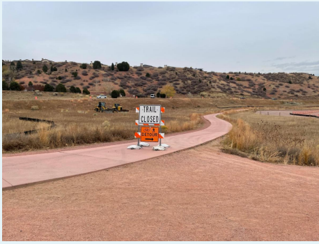
"Trail Closed" and detour directional sign south of Gateway Road