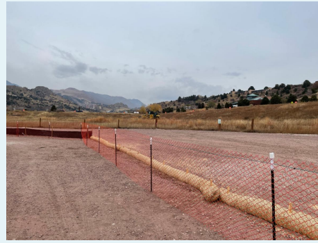
Work area on east side of overflow parking lot and through Foothills Trail